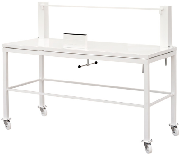
Table with wheels designed for quick and easy replacement of the basketball board.

Its dimensions are 2050 x 830 x 1700 mm and it is entirely made of steel. It consists of a base frame structure and a height adjustable table top.